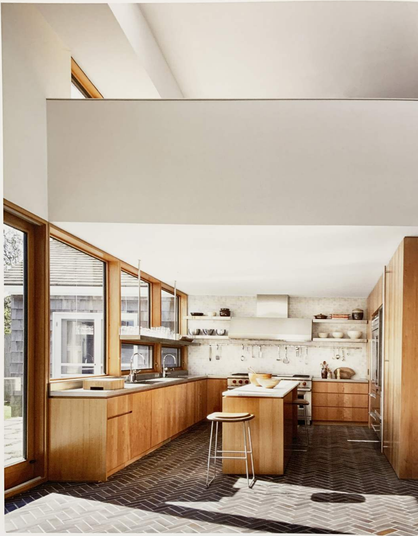
Above: The same Spanish cedar that clads the dining area's walls was used on custom cabinets in the partially open kitchen, which is tucked under the office loft. Marble and stainless-steel accents complete the space. Opposite: A glass corridor connects the new spaces to a large former barn that functions as the main living room.