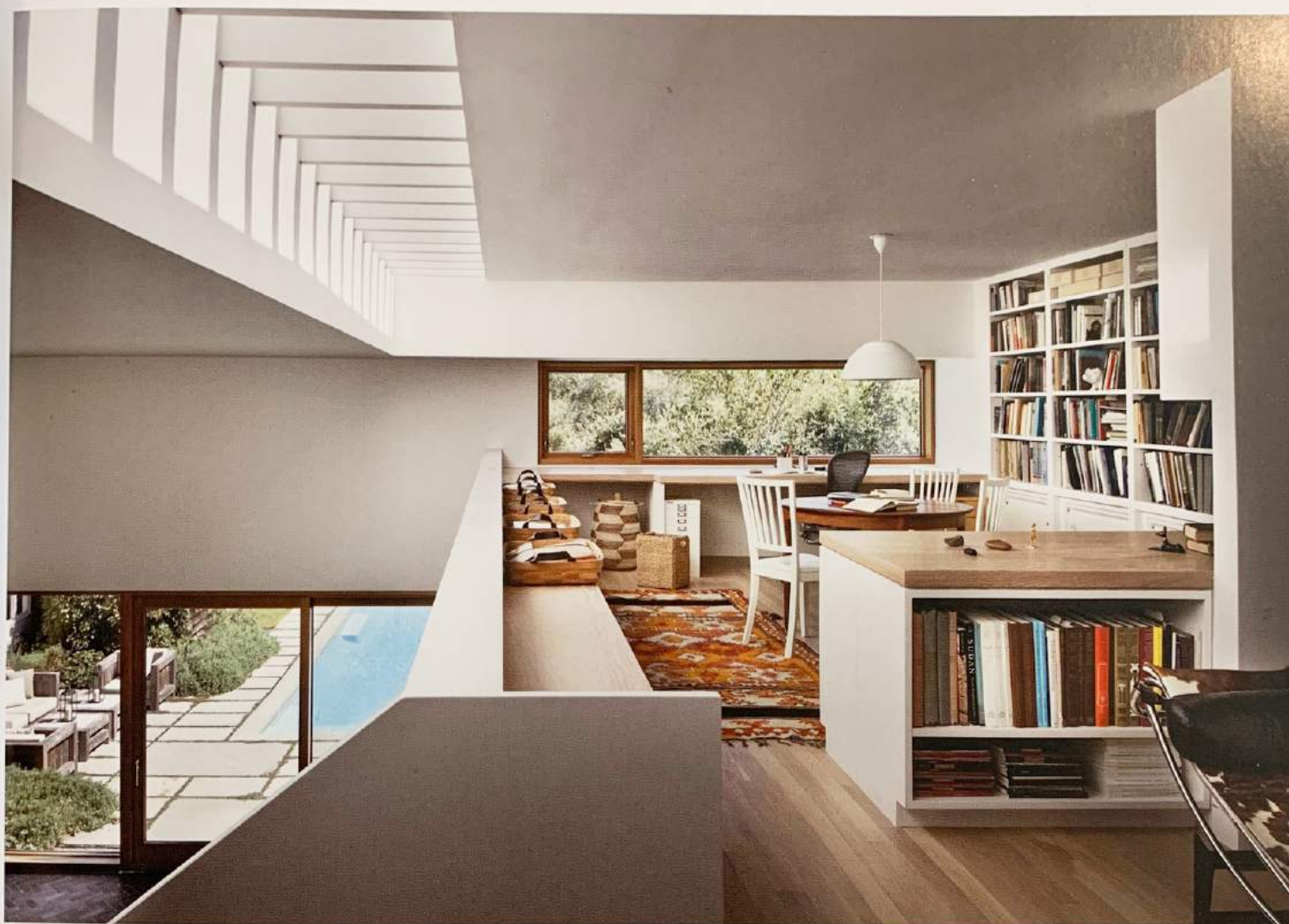
Above: The office loft benefits from a series of closely placed, rectangular skylights that run along the spine of the newly added volume. Opposite: Finlike oak treads lead to an office loft above. Circulation is arranged along one side of the new space, and halls are filled with natural light from the long wall of windows. Walls clad in Spanish cedar add warmth and texture, and modulate the transition from smooth white surfaces above to dark brick below.