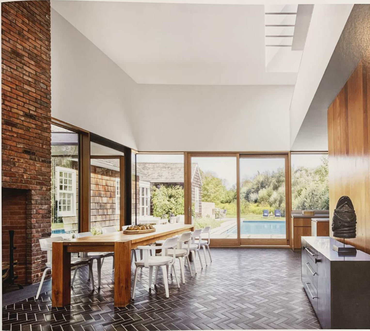
Above: The dining area sits next to an open fireplace constructed of reclaimed bricks. The bronze-and-leather sideboard is from BDDW and the dining chairs are by Walter Gropius. Opposite: A sculptural staircase with a handrail constructed from a solid sheet of Corian is the only element to break into the otherwise open space, though its strongly diagonal line relates to the herringbone-patterned brick floor beneath.